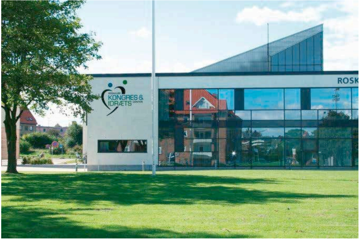
Roskilde Congress Centre, Møllehusvej 15, 4000 Roskilde